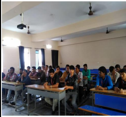
Students listening to the technical seminar