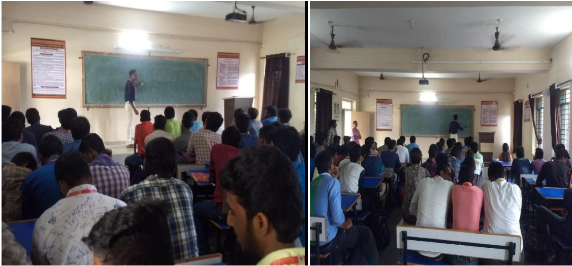
Students interestingly listening to the seminar